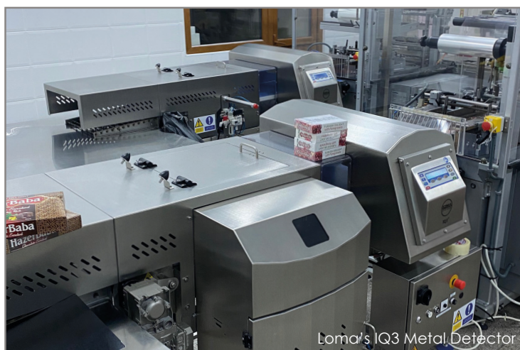
Loma's IQ3 Metal Detector

Having previously worked with Loma, they requested the latest metal detection solution, with built-in reject, capable of the best inspection standards across their multiple production lines.