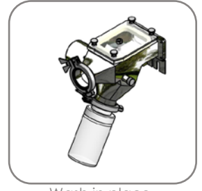
Wash in place