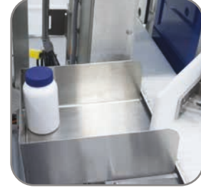
Stainless Steel Reject

The Insight BottleChek is available with different reject options: A Reject Tray where rejected product is pushed off the production line into a stainless steel tray, a standard, lockable reject bin or a side-by-side transfer to another conveyor belt.