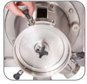
Sealed Valve Reject

There are two different reject systems available to ensure contaminants are safely and reliably rejected from the production line. The Sealed Valve Reject is completely dust-tight thus eliminating any cross contamination. The Cowbell-type diverter style reject will reject contaminated product into a separate reject bin.