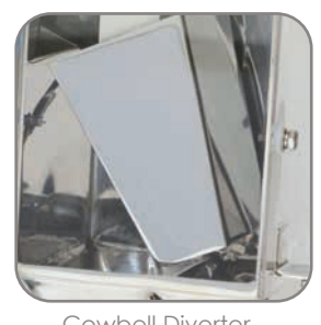
Cowbell Diverter Reject