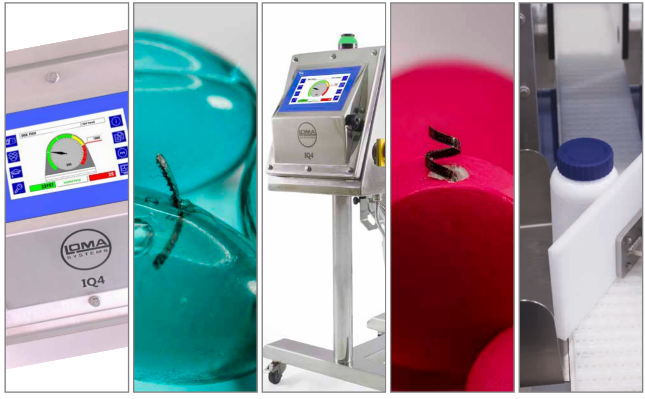
Designed to Survive®