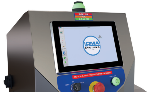
X5C COMPACT X-RAY

With its low cost of ownership, this X-ray solution represents the perfect step up for manufacturers aiming to achieve a higher level of Critical Control Point (CCP) protection.