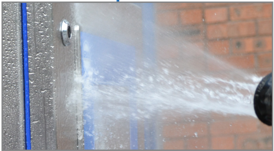
Environment Ready, IP69k Independently Rated

Fully IP69k rated and designed for harsh high-temperature, high-pressure wash-down environments with easy to clean components.