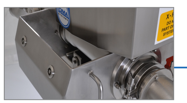
Removable cassette for easy cleaning The cassette is designed to make cleaning easy and provide a simple option when changing between different size pipes.

The X5 Pipeline provides offers great inspection capabilities on Bone as well as stainless steel, ceramic, glass and dense plastics.