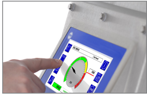
7" Color Touchscreen

Standard across all of the IQ4 range, the industry leading 7" touchscreen enhances usability over previous generation metal detectors.