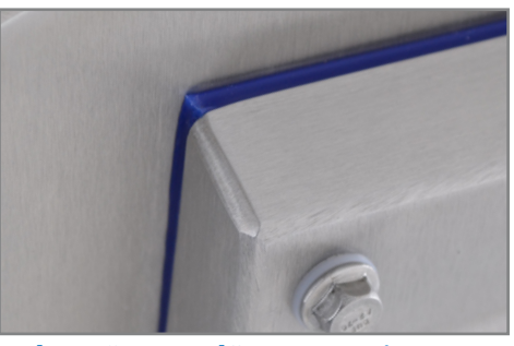
Robust "Beyond" IP69K Rating

The newly designed interface makes light work of setting, running and maintaining the IQ4 range and helps to minimizes operator errors